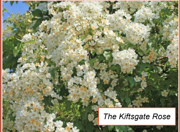
The Kiftsgate Rose

It was a remarkable sight and resembled a cascading waterfall amongst the trees. Walking to the lower garden we saw the magnificent 'swimming pool' lawn with views to the distant hills of Malvern and to the glorious Vale of Evesham. Exhausted now, we climbed back to the house for a well earned cup of tea in their tea room. Of course, no one could resist buying some of the lovely plants for sale before we left.